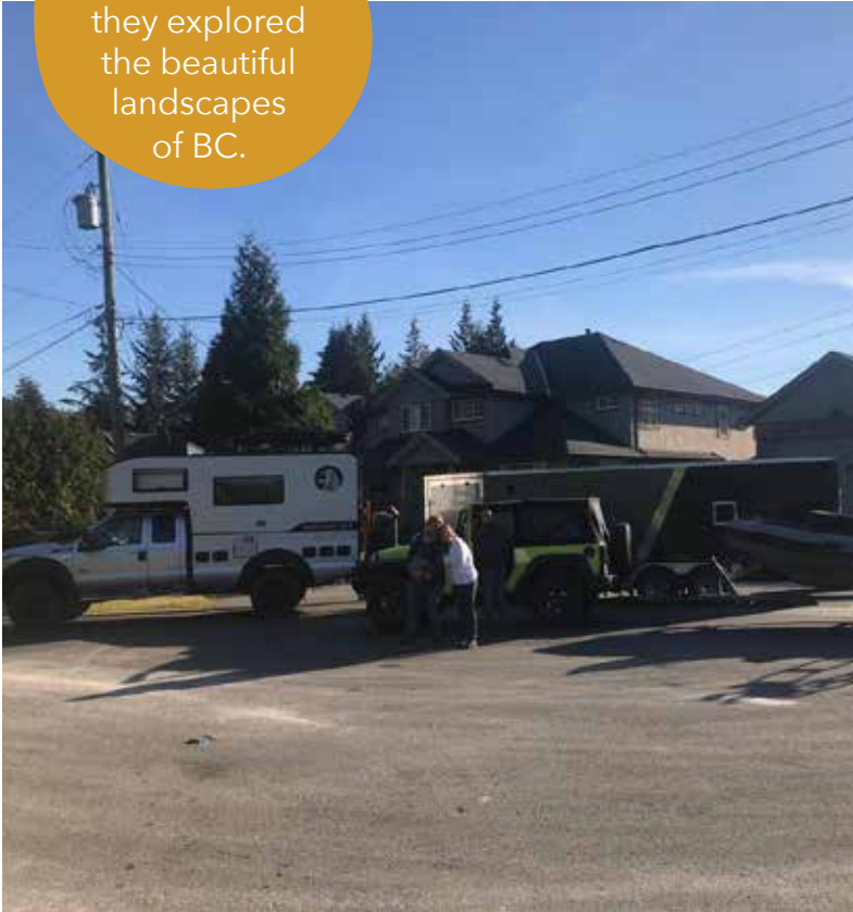
MOVING DAY, LEAVING ANMORE NOV 2022

Their relationship blossomed as they explored the beautiful landscapes of BC.