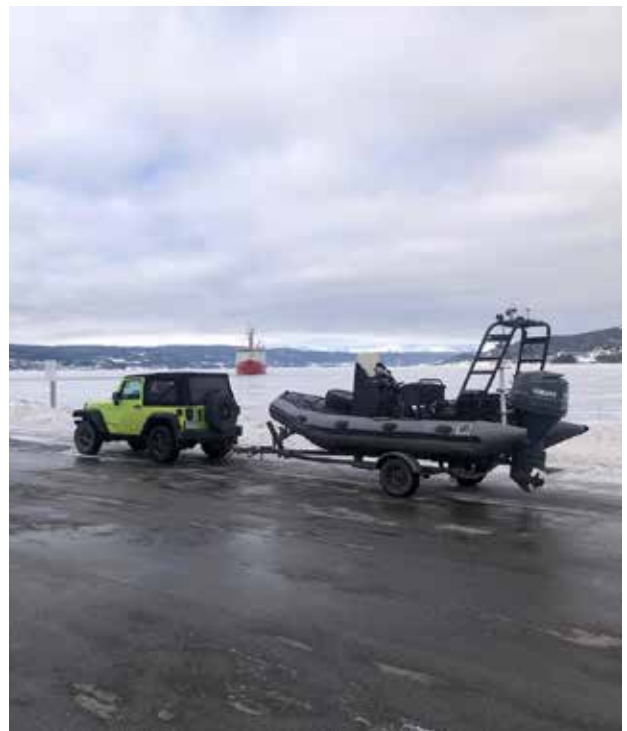
MOVING JOURNEY, LEAVING NOVA SCOTIA ON THE WAY TO NEWFOUNDLAND