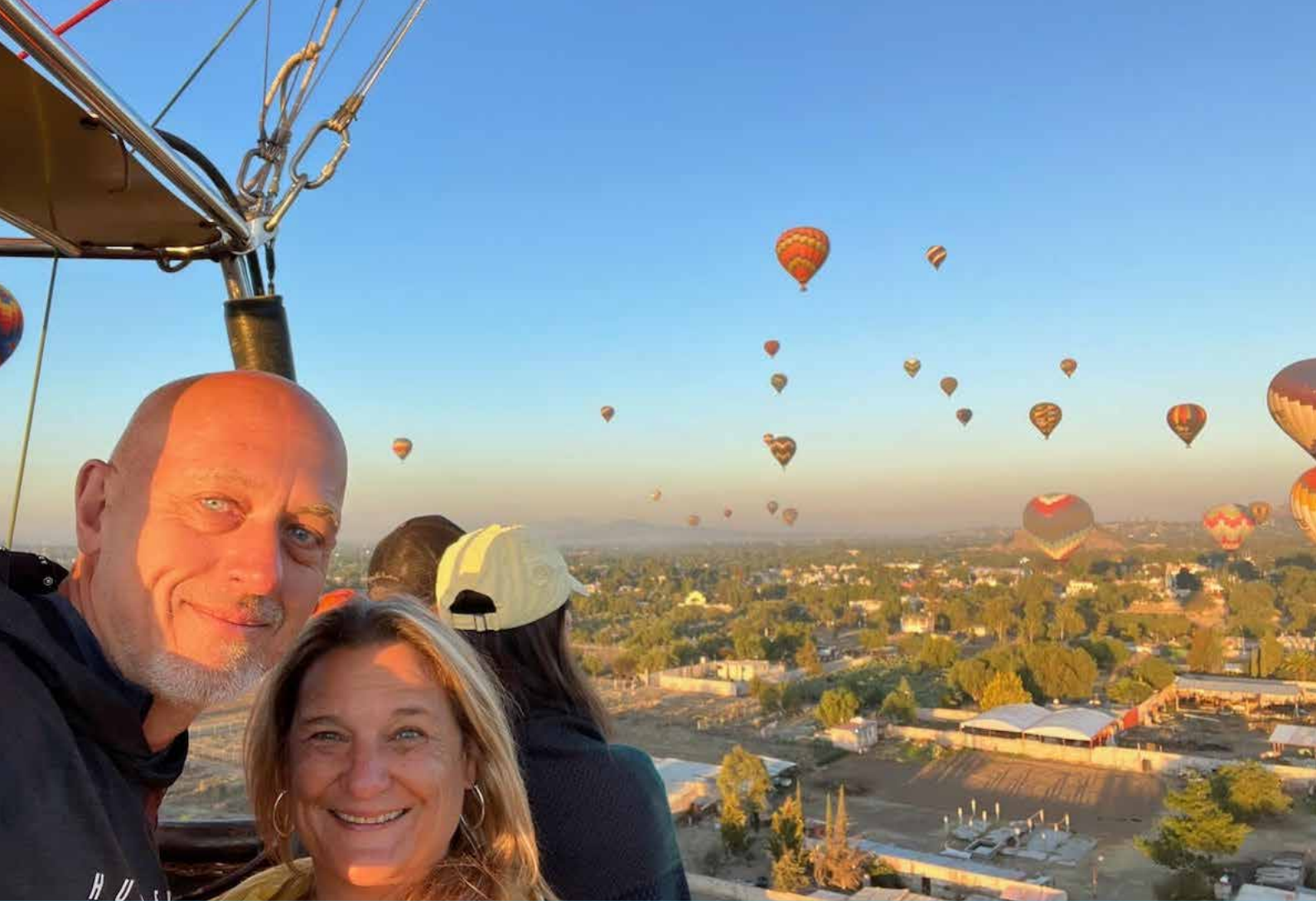
EARLY MORNING HOT AIR BALLOON RIDE IN TEOTIHUACAN, MEXICO .