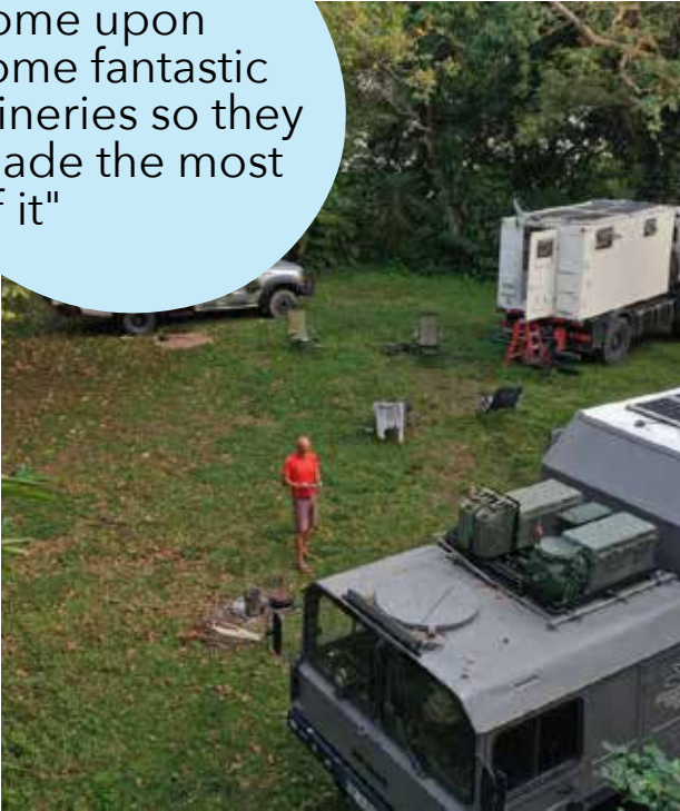
THE YUCATAN JUNGLE WITH THEIR GERMAN AND FRENCH OVERLANDING FRIENDS

"they had come upon some fantastic wineries so they made the most of it"